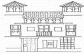
PALACIO DE LOS NAVAS S.XVI

To authorize your vehicle to drive along Recogidas and San Matias Street inform us about the plate number when you check-in, not before. You are not allowed to drive along Reyes Católicos or Gran via de Colón Street.