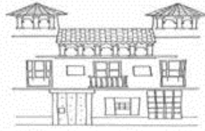
PALACIO DE LOS NAVAS S. XVI

In order to authorize your vehicle to drive along Recogidas and San Matias Street inform us about the plate number when you check-in, not before. You are not allowed to drive along Reyes Católicos or Gran via de Colón Street.